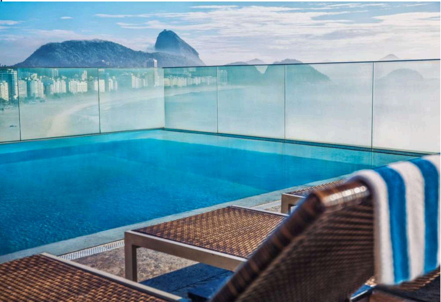
Miramar by Windsor