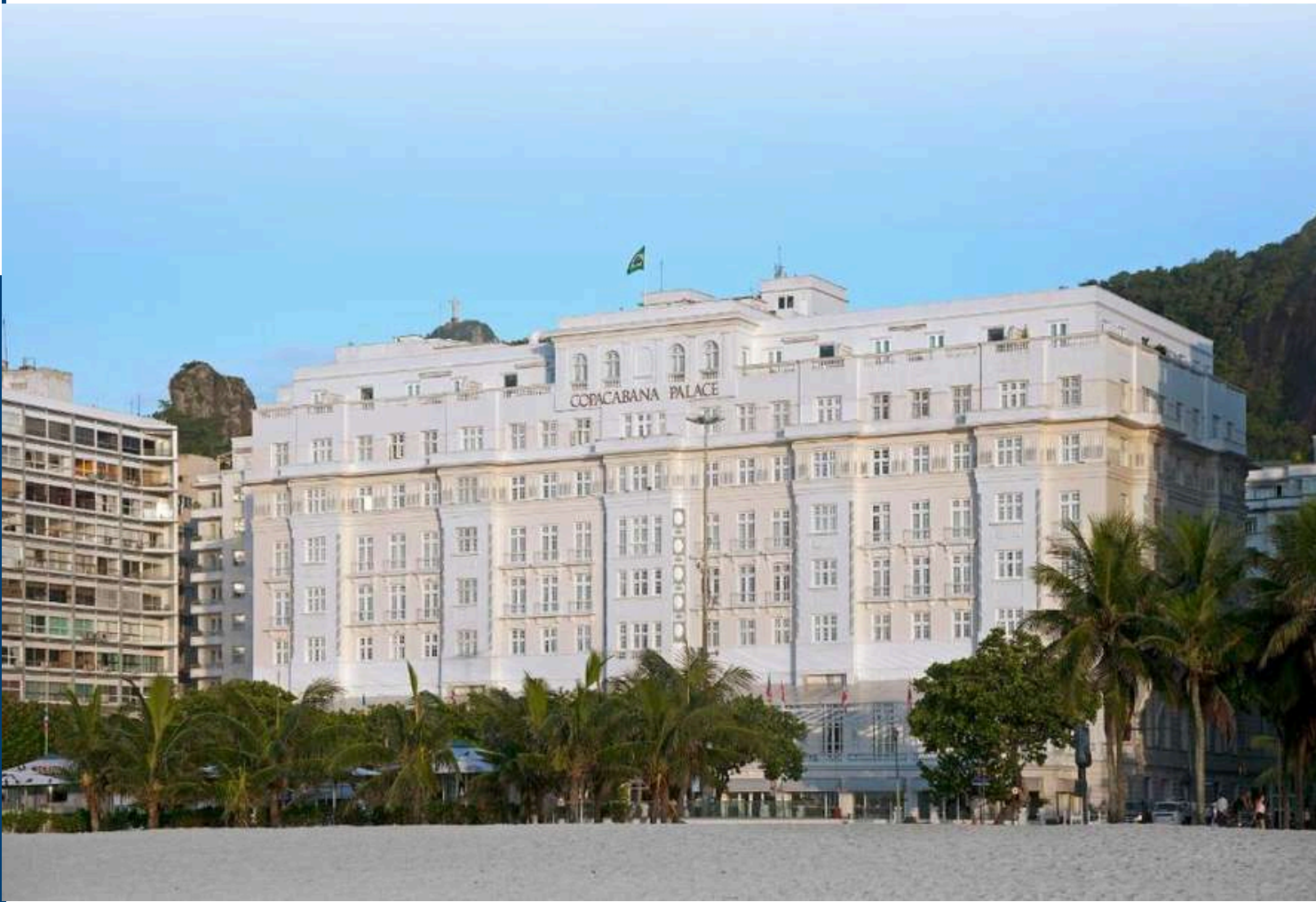
Belmond Copacabana Palace