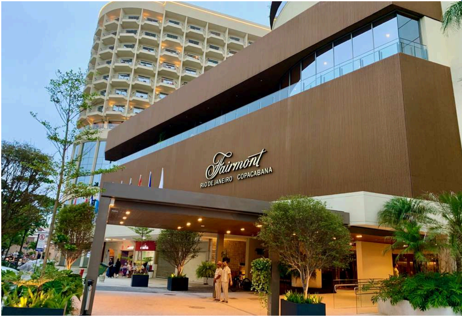
Fairmont Rio de Janeiro Copacabana